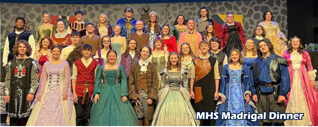
MHS Madrigal Dinner