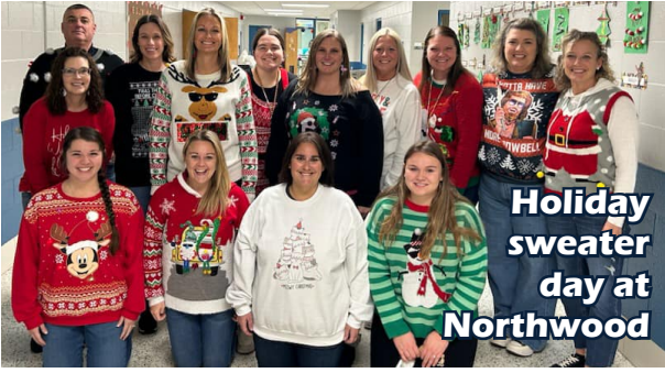
Holiday sweater day at Northwood